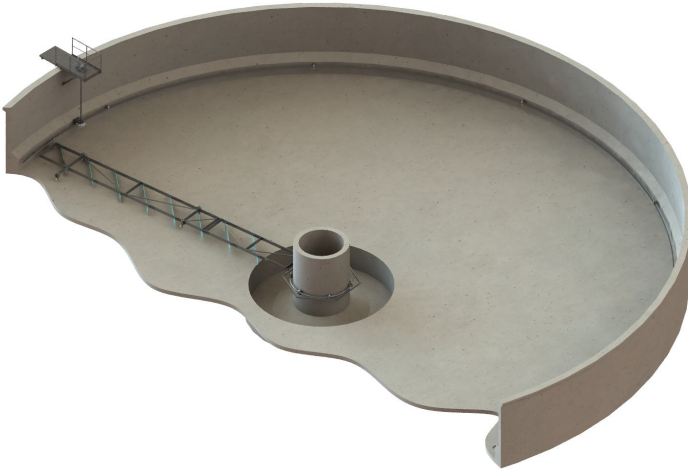
Circular suction scraper ECBS with dry placed drive unit