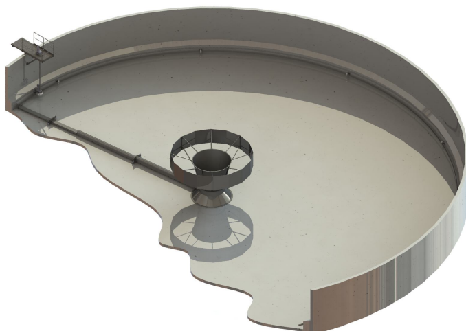
Circular suction scraper ECSS with dry placed drive unit (single arm option)

Optionally , depending on the capacity of the settling tank, the ECSS sludge pump can be offered with a single suction arm.