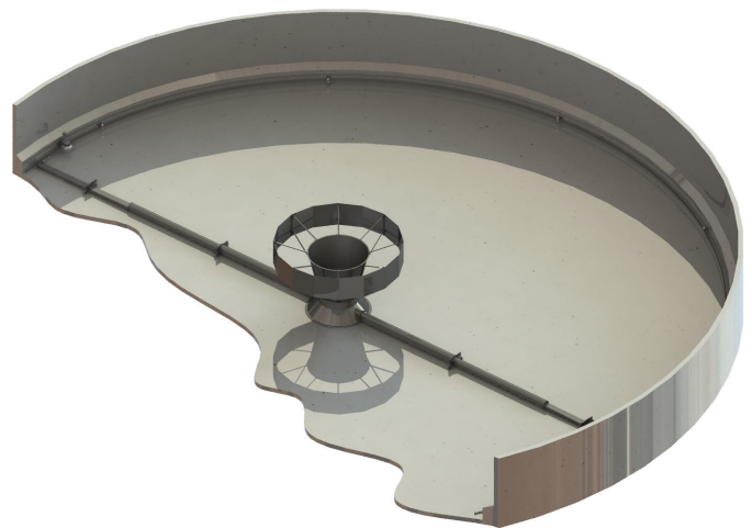
Circular suction scraper ECSS with submerged drive unit