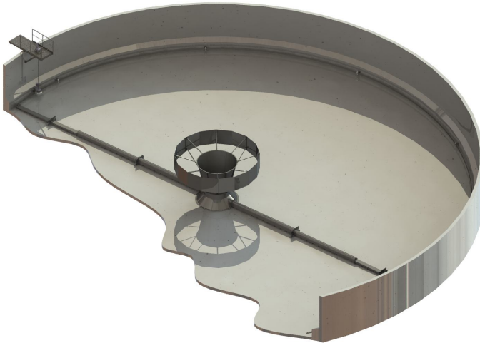
Circular suction scraper ECSS with dry placed drive unit